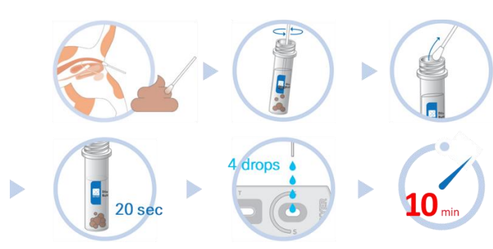
[Summary of Test Procedure]